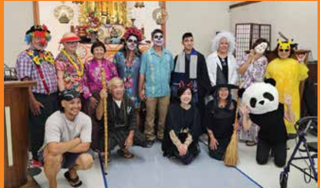
Participants Over 18