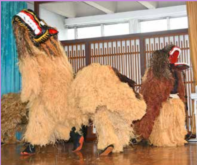
◀ Shishimai (lion dance) performed by HOCA