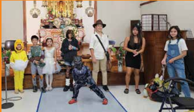
Participants Under 19