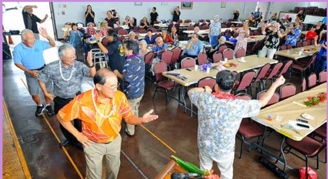
▶ Kachashi performed by all to close the event