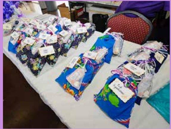
▶ Keirokai gift bags