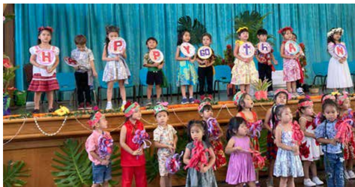
Enthusiastic rendition of Happy Anniversary, complete with signs, by the entire cast of Lumbini Preschool.