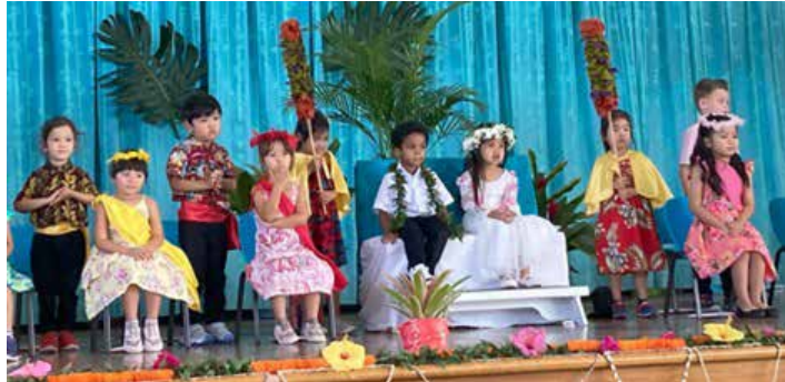
The court of the May Day King and Queen, complete with Kahili Bearers. Note how the children were taught to hold their hands. Such attention to detail!

The celebration of Lumbini's 60th Anniversary immediately followed the May Day Program. The