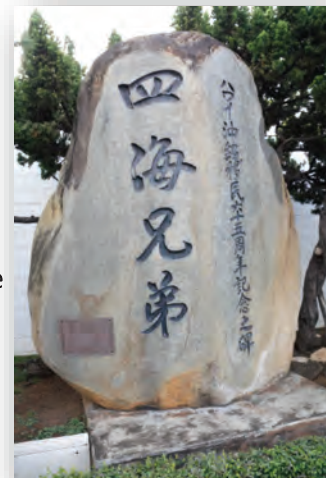
Shi Kai Kei Tei... "All within the four seas are brothers"

The goal of Ukajidebiru—Jikoen's Fund Raising Campaign is to raise $1,000,000 to address accessibility, safety and health issues. The priorities are as follows: (1) Install an elevator-lift (2) Repair water leaks from the windward walls (3) Bring waste disposal systems up to code (4) Replace railings (5) Repair roof leaks and tower damage (6) Repair perimeter walls (7) Bring electrical and waste disposal systems up to code (8) Improve safety in parking areas (9) Renovate restrooms and kitchen facilities and install a cooling system for the Okinawa Memorial Hall.